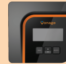
V-Portal Phone Adapter